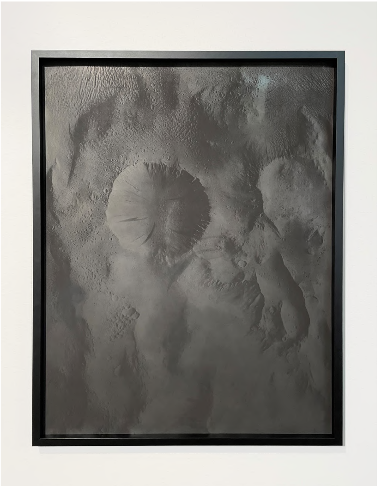
Hugo DEVERCHÈRE (b.1988) The Far Side - Regolith #01

2022 Oxydes, carbone, minéraux et terre sur plaque photopolymère Oxyde, carbon, minerals and soil on photopolymer plate 104 x 80 cm Unique