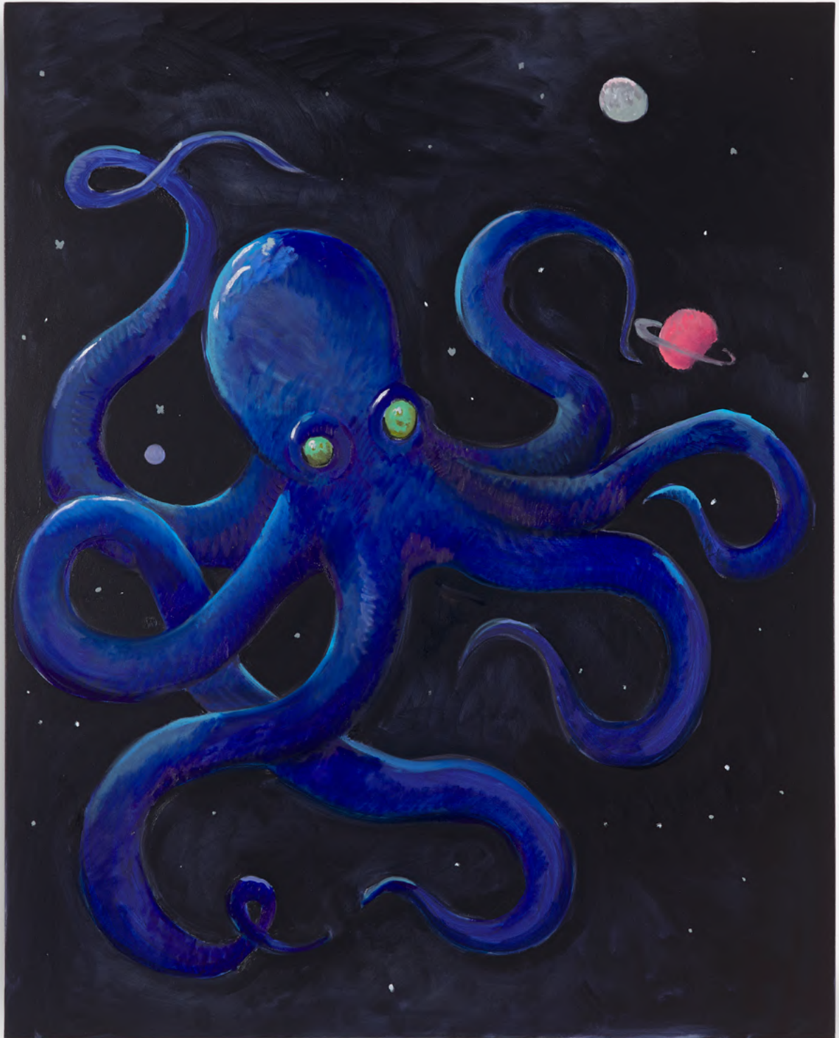
Charles HASCOËT (b.1985) Ce qui est en bas | What's below

2022 Huile sur toile | Oil on canvas 160 x 130 cm