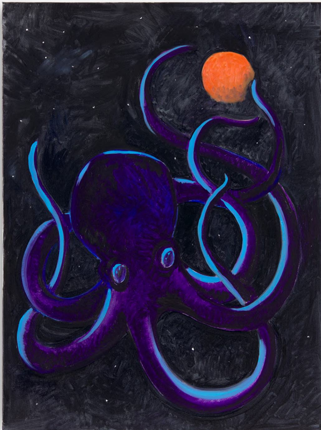
Charles HASCOËT (b.1985) L'incal noir | The black incal

2022 Huile sur toile | Oil on canvas 80 x 60 cm