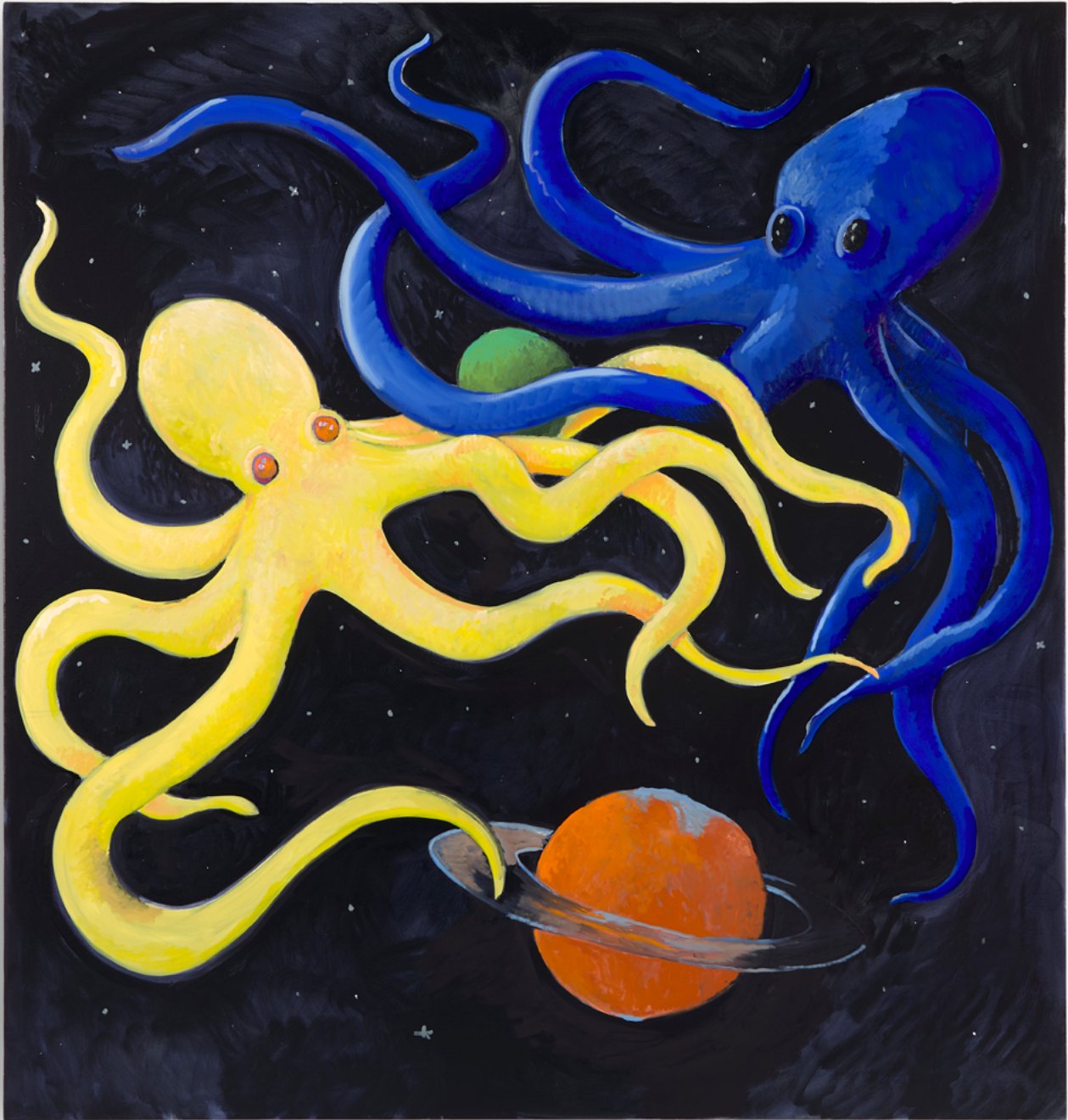
Charles HASCOËT (b.1985) Imperatrice | Empress

2022 Huile sur toile | Oil on canvas 190 x 180 cm