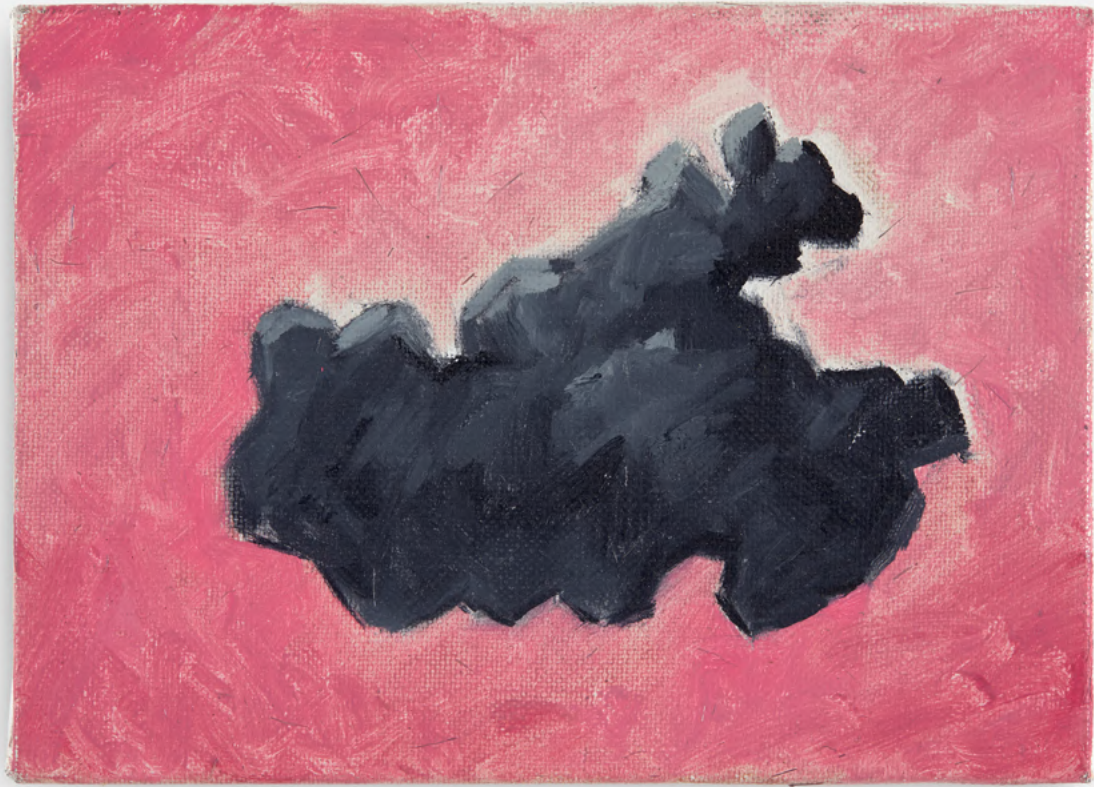
Charles HASCOËT (b.1985) Asteroïde de ben | Ben's asteroid

2022 Huile sur toile | Oil on canvas 19 x 24 cm