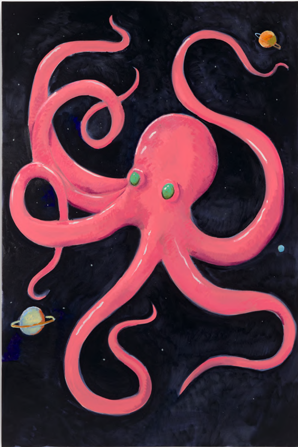
Charles HASCOËT (b.1985) La galaxie qui songe | The Dreaming Galaxy

2022 Huile sur toile | Oil on canvas 192 x 130 cm