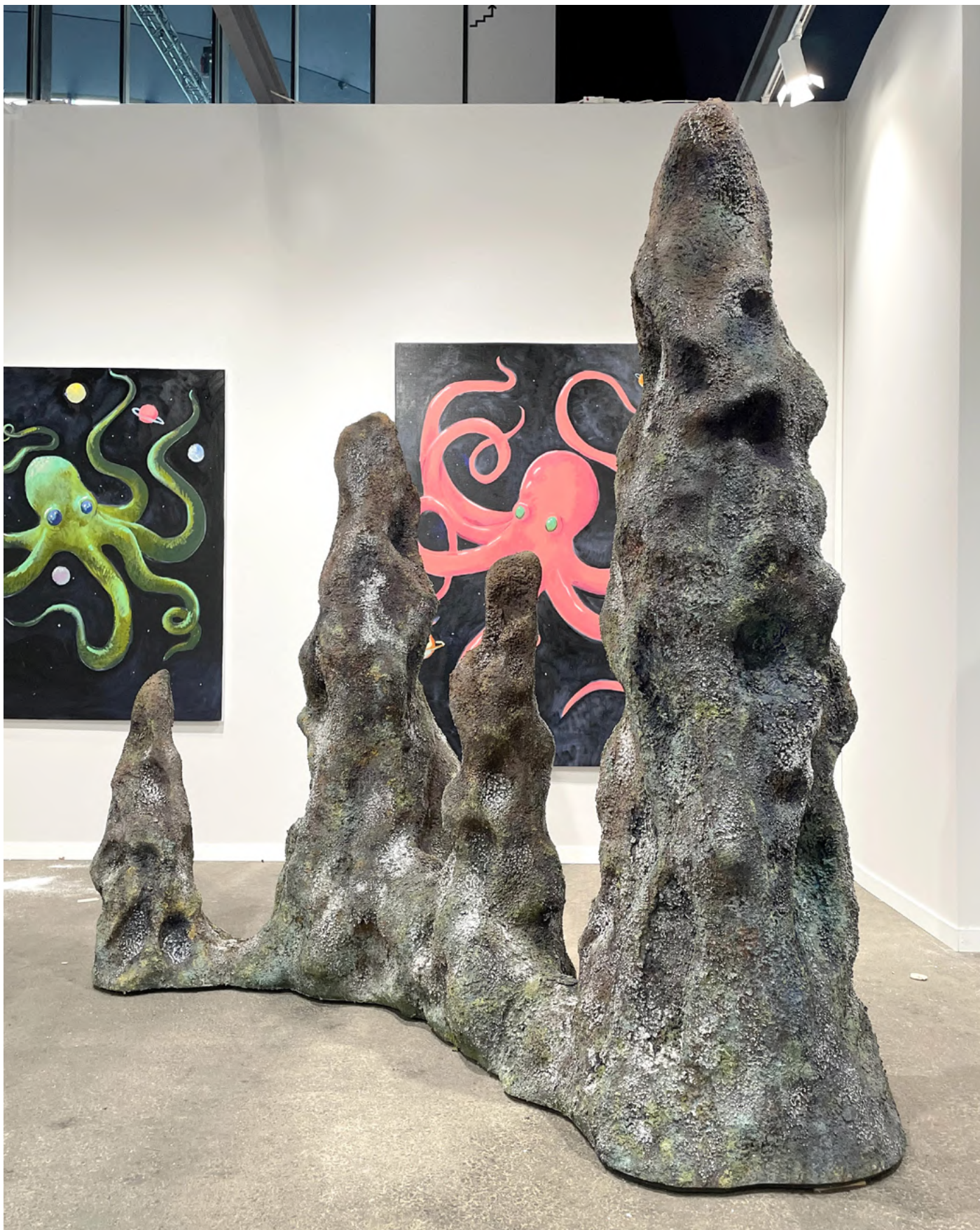
Hugo DEVERCHÈRE (b.1988) The Far Side - Concretion #01

2022 Mousse, Sels, Sucres, pigments, oxydes, carbone, terre Foam, salt, sugar, pigment, oxyde, carbon, soil 205 x 102 x 210 cm Unique