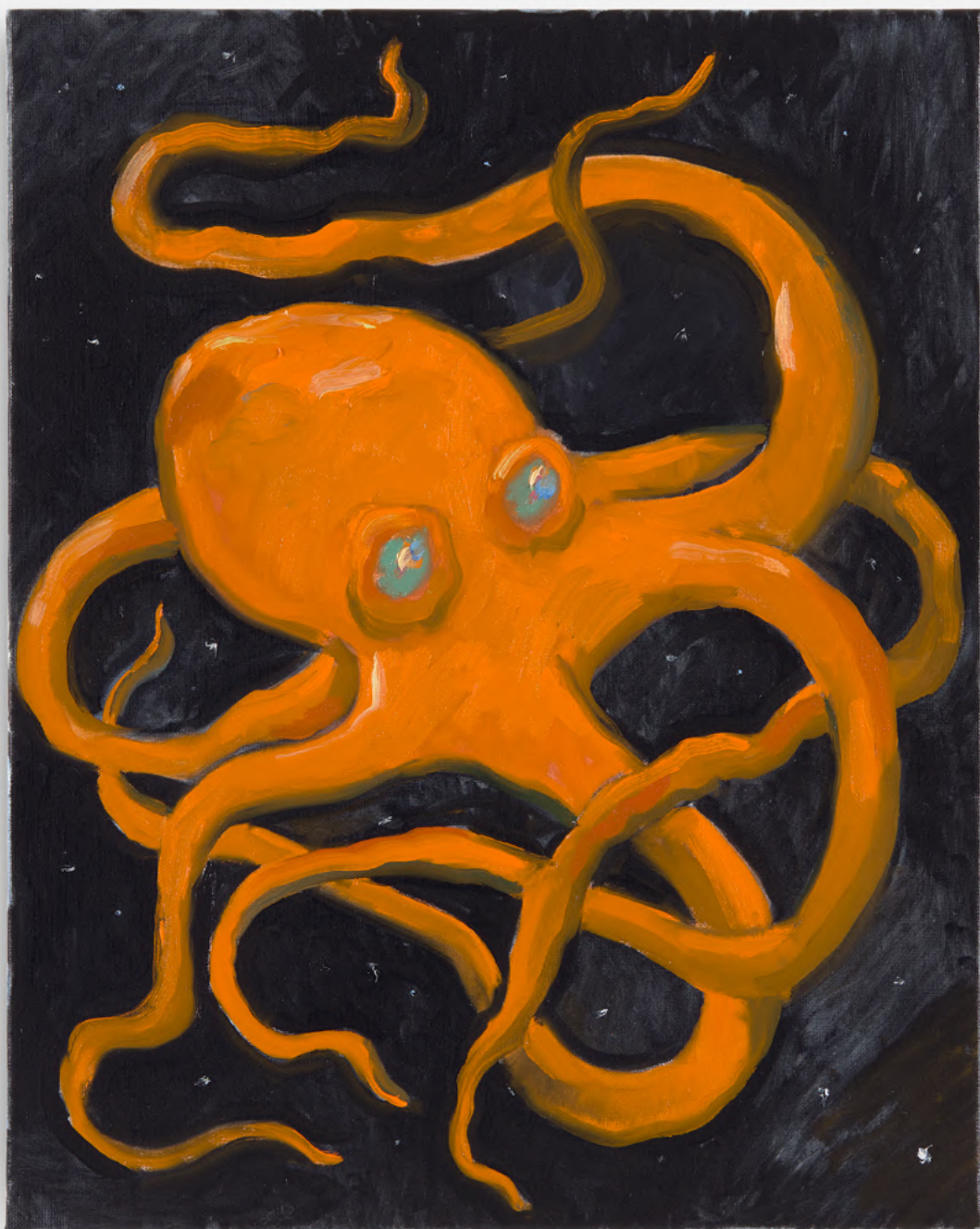
Charles HASCOËT (b.1985) Psyco-poulpe orange | Orange psycho-octopus

2022 Huile sur toile | Oil on canvas 61 x 50 cm