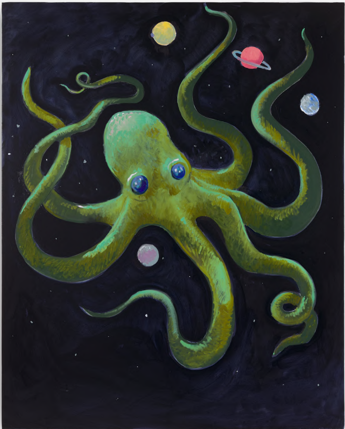
Charles HASCOËT (b.1985) Ce qui est en haut | What is up there

2022 Huile sur toile | Oil on canvas 160 x 130 cm