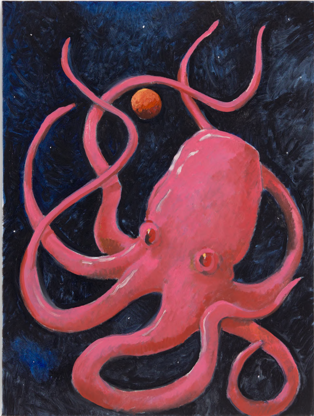
Charles HASCOËT (b.1985) Psyco-poulpe rose | Pink psycho-octopus

2022 Huile sur toile | Oil on canvas 80 x 60 cm