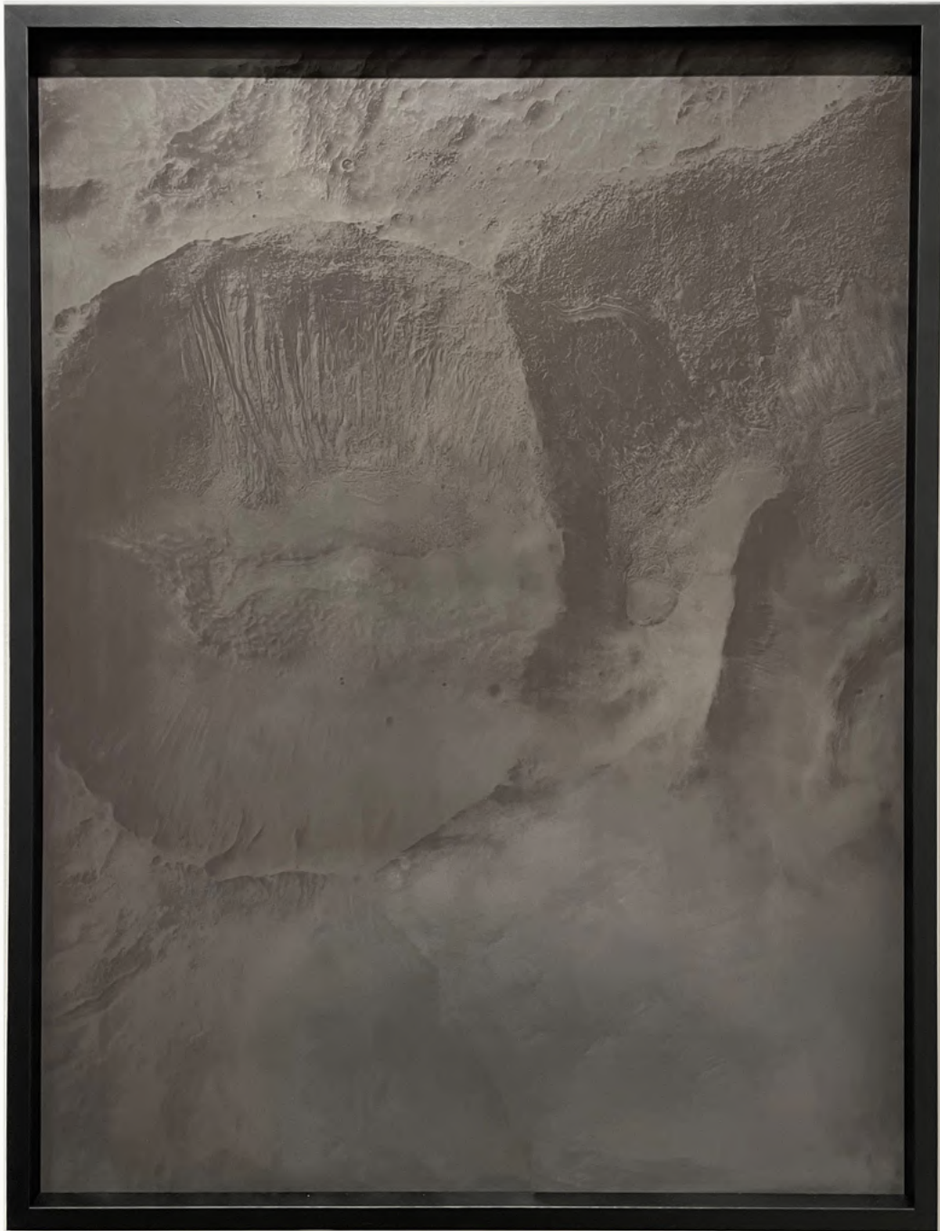
Hugo DEVERCHÈRE (b.1988) The Far Side - Regolith #02

2022 Oxydes, carbone, minéraux et terre sur plaque photopolymère Oxyde, carbon, minerals and soil on photopolymer plate 104 x 80 cm Unique