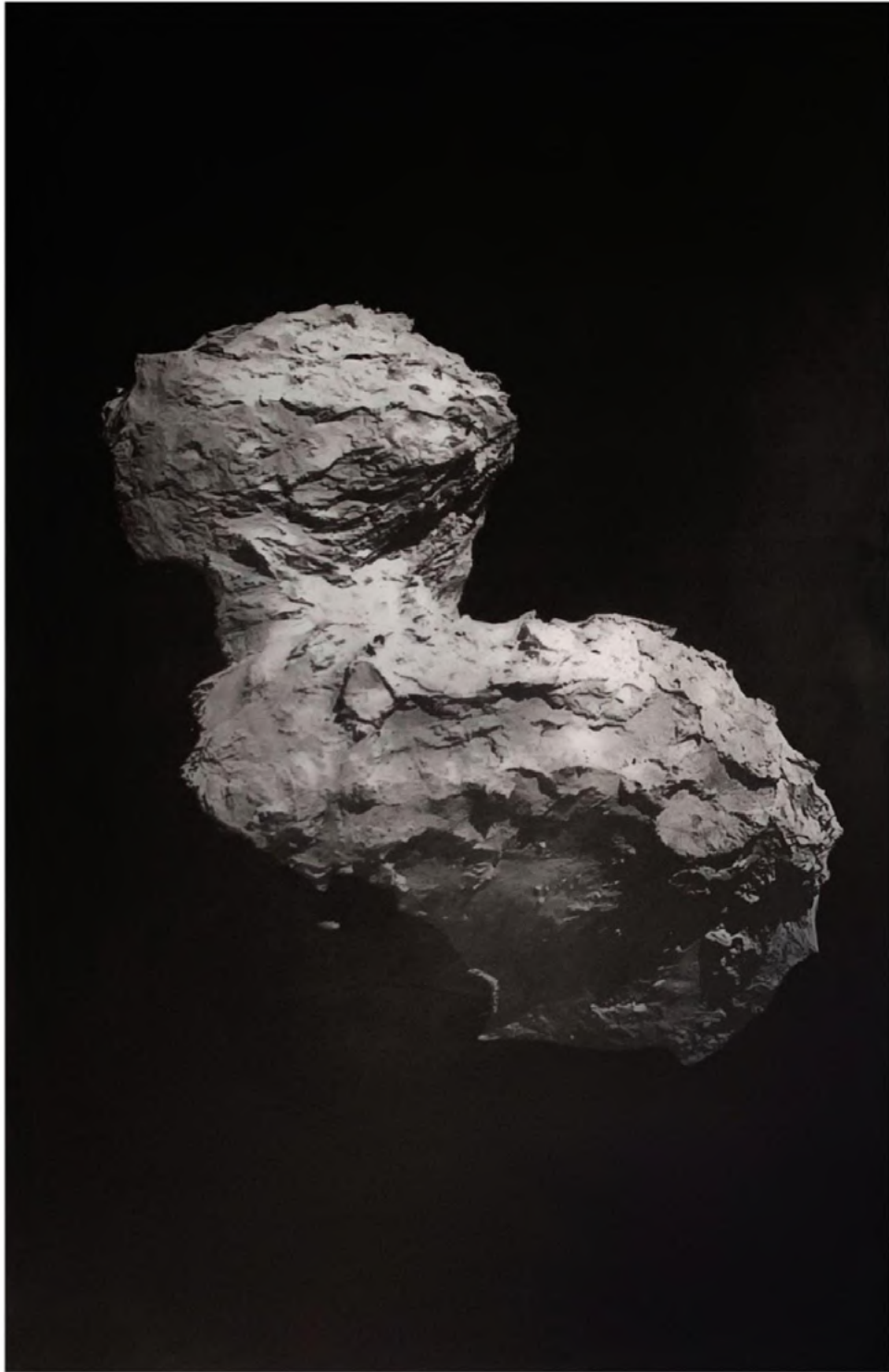
Hugo DEVERCHÈRE (b.1988) The Far Side - 67P/T-G #01

2022 Oxydes, carbone, minéraux et terre sur plaque photopolymère Oxyde, carbon, minerals and soil on photopolymer plate 61 x 39 cm Unique