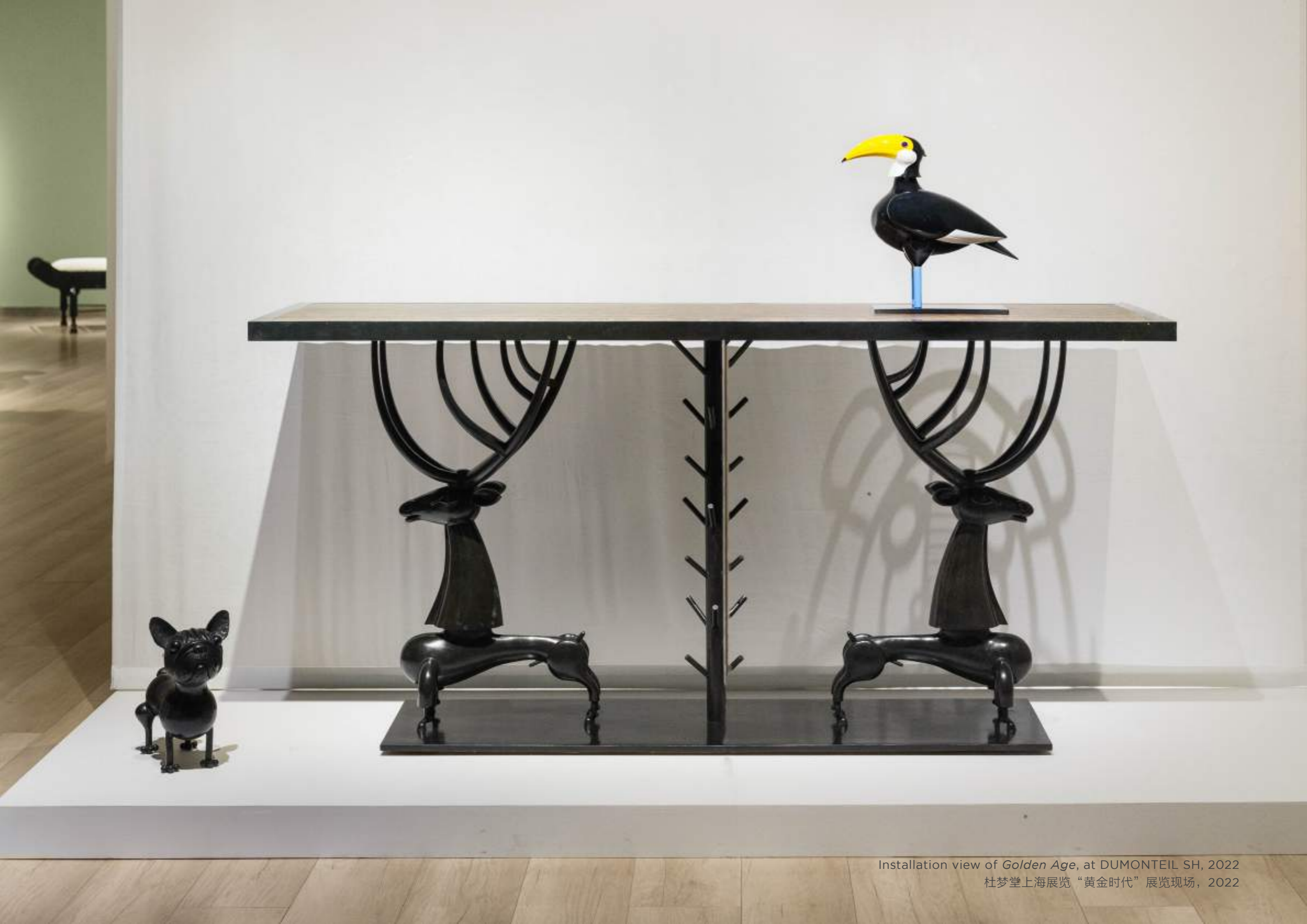
Installation view of Golden Age , at DUMONTEIL SH, 2022 杜梦堂上海展览“黄金时代”展览现场，2022