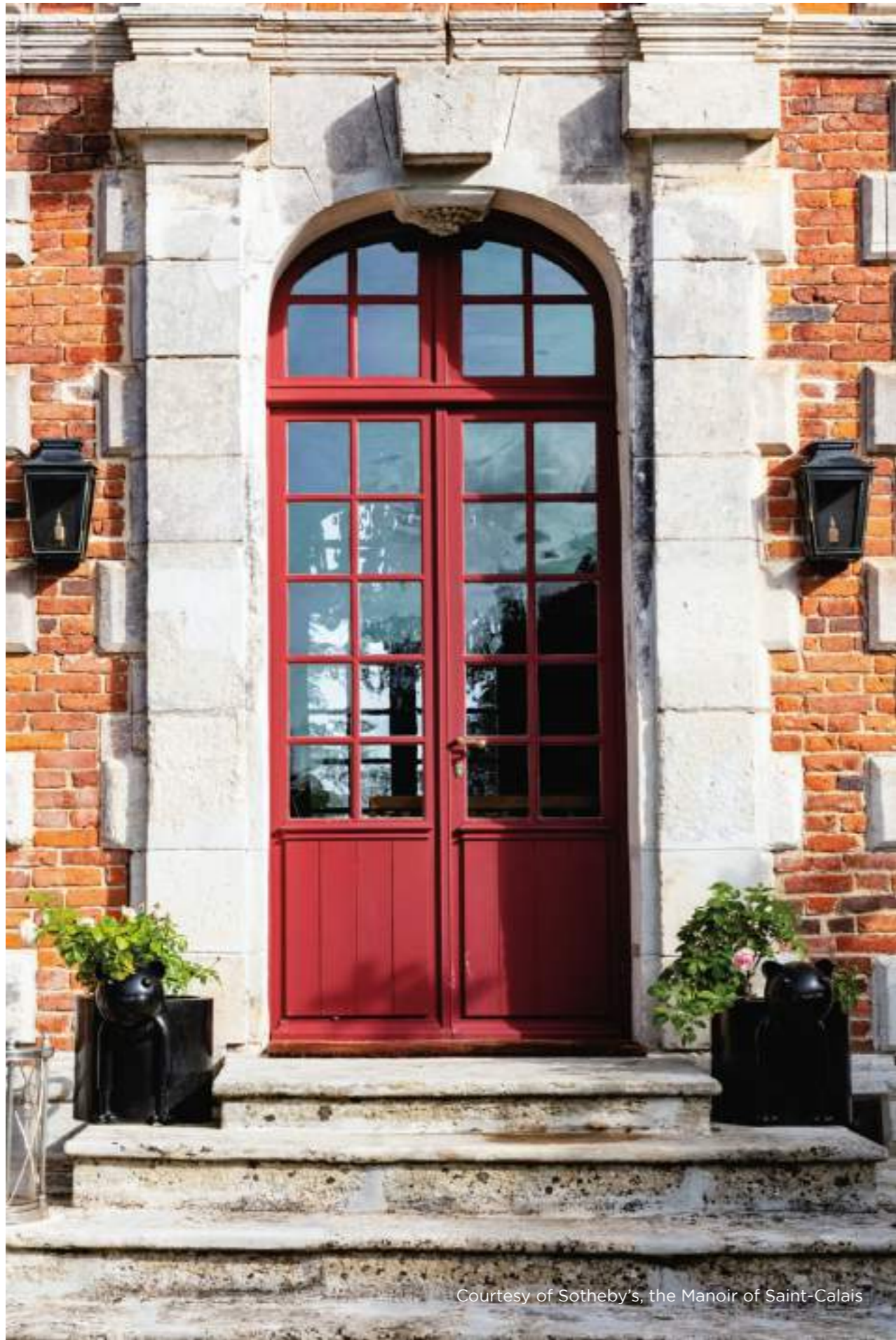
the Manoir of Saint-Calais