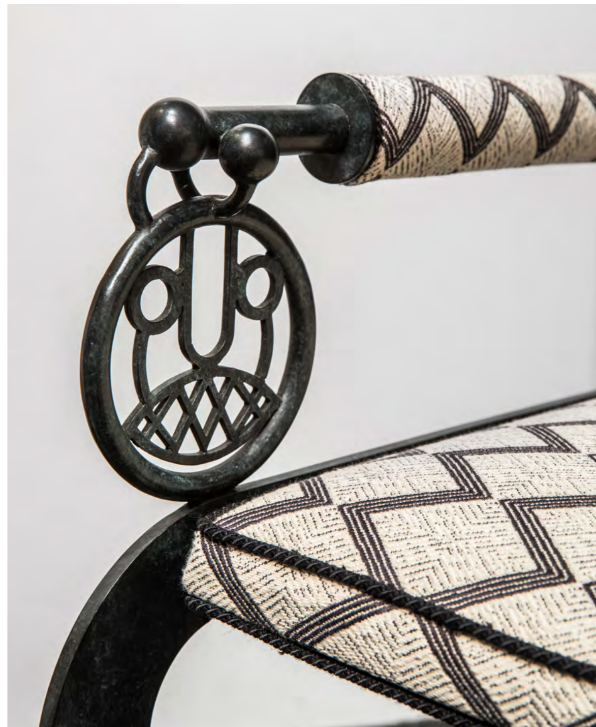
« Darius » Armchair