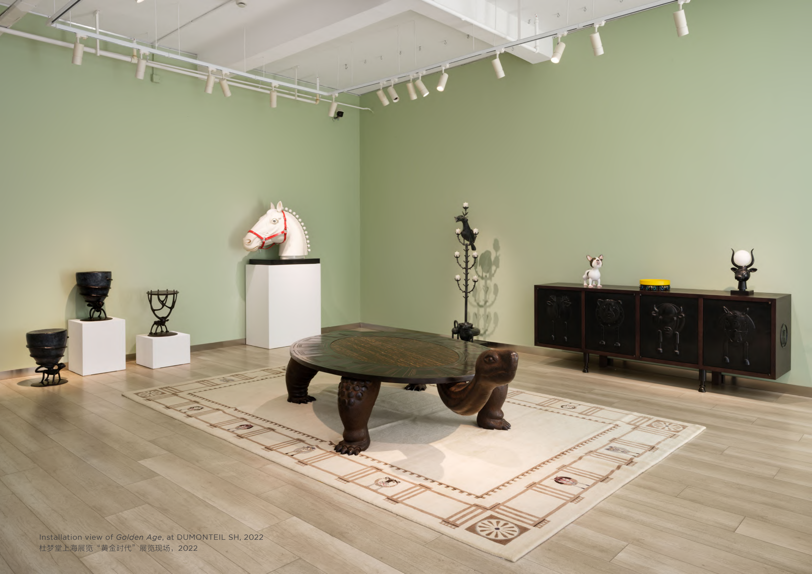
Installation view of Golden Age , at DUMONTEIL SH, 2022 杜梦堂上海展览“黄金时代”展览现场，2022