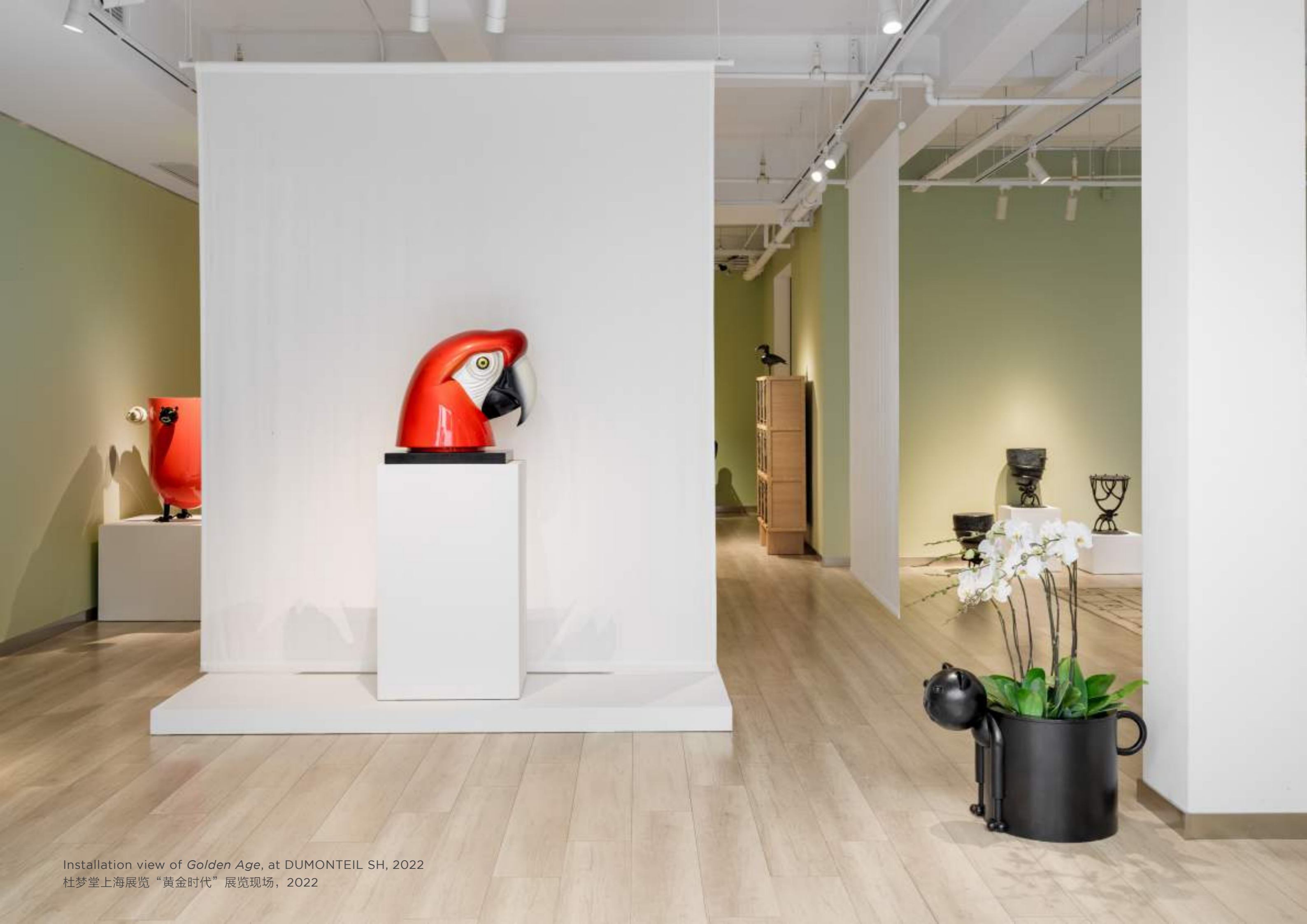
Installation view of Golden Age , at DUMONTEIL SH, 2022 杜梦堂上海展览“黄金时代”展览现场，2022