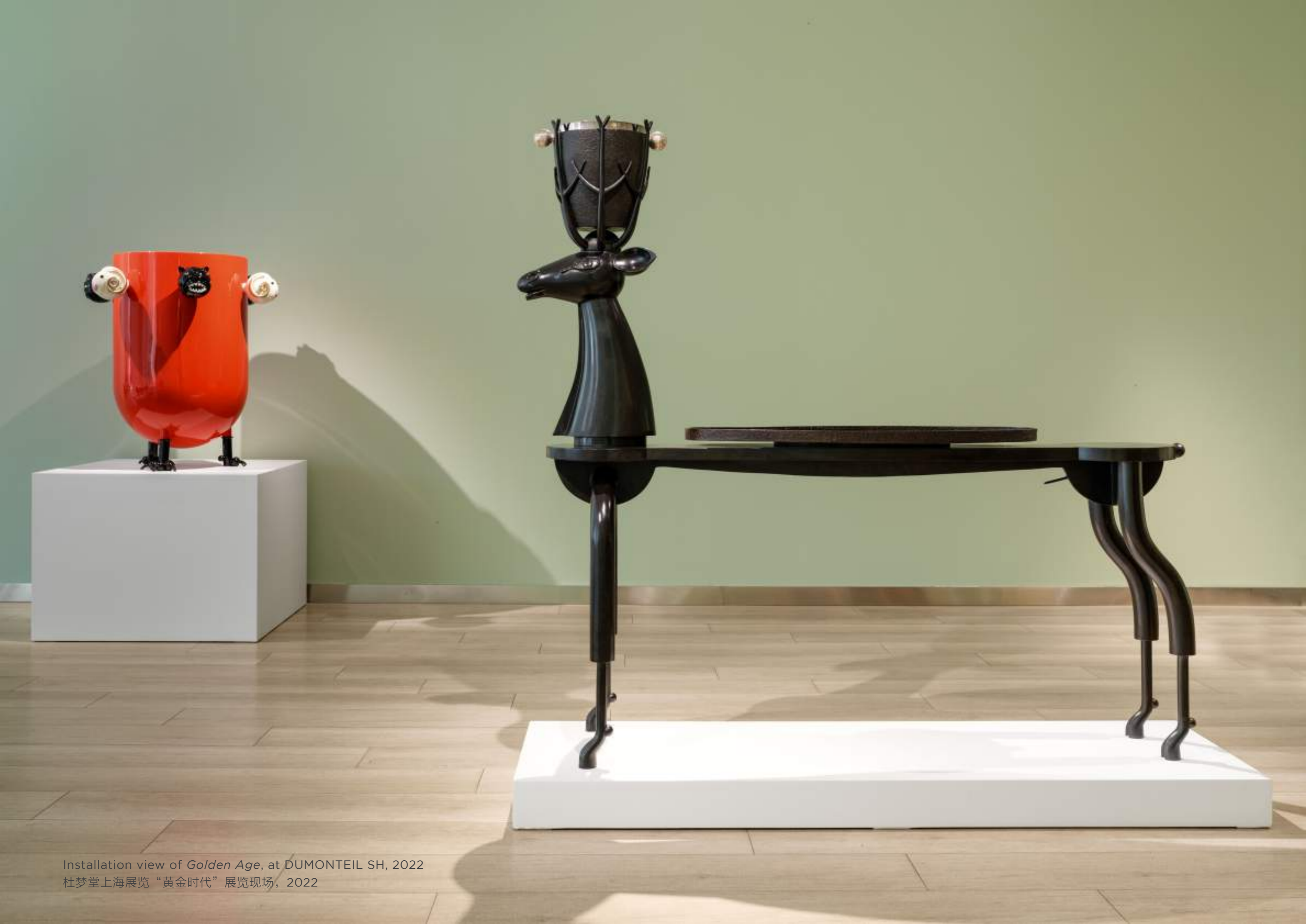
Installation view of Golden Age , at DUMONTEIL SH, 2022 杜梦堂上海展览“黄金时代”展览现场，2022