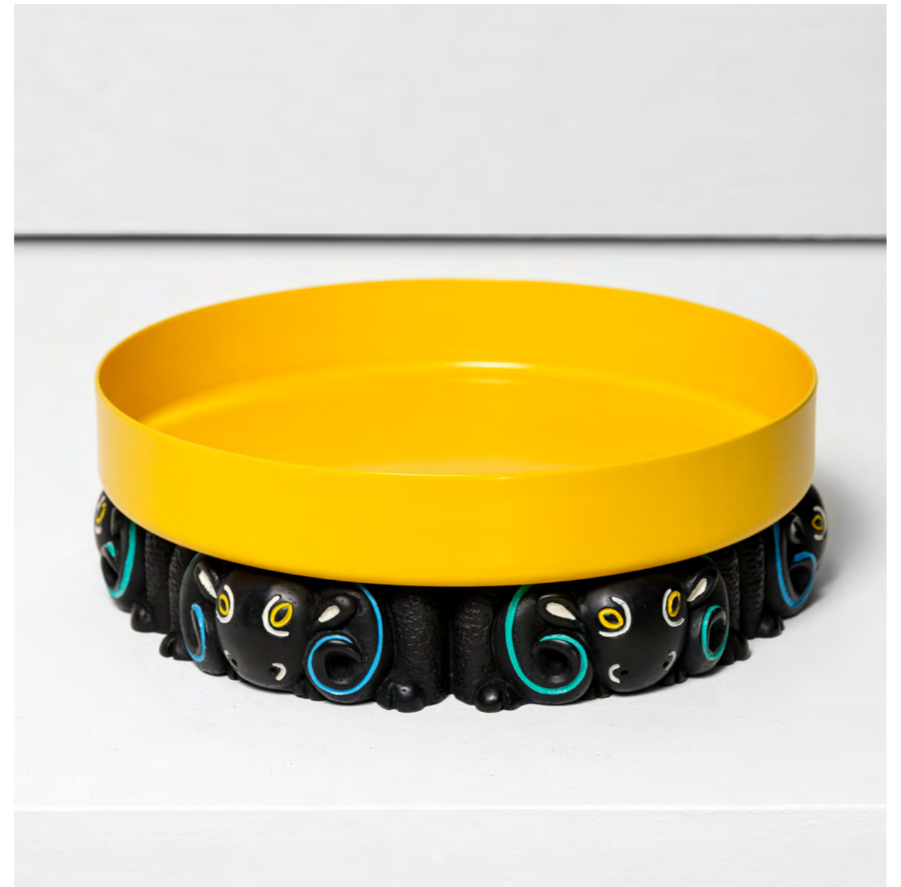
Ram Cup (yellow)