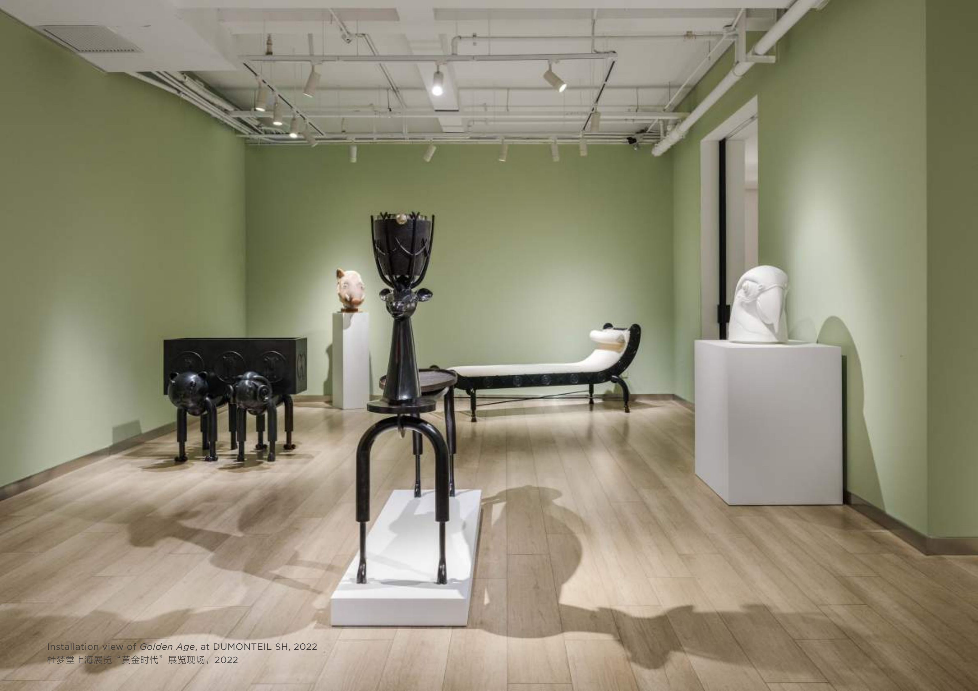
Installation view of Golden Age , at DUMONTEIL SH, 2022 杜梦堂上海展览“黄金时代”展览现场，2022