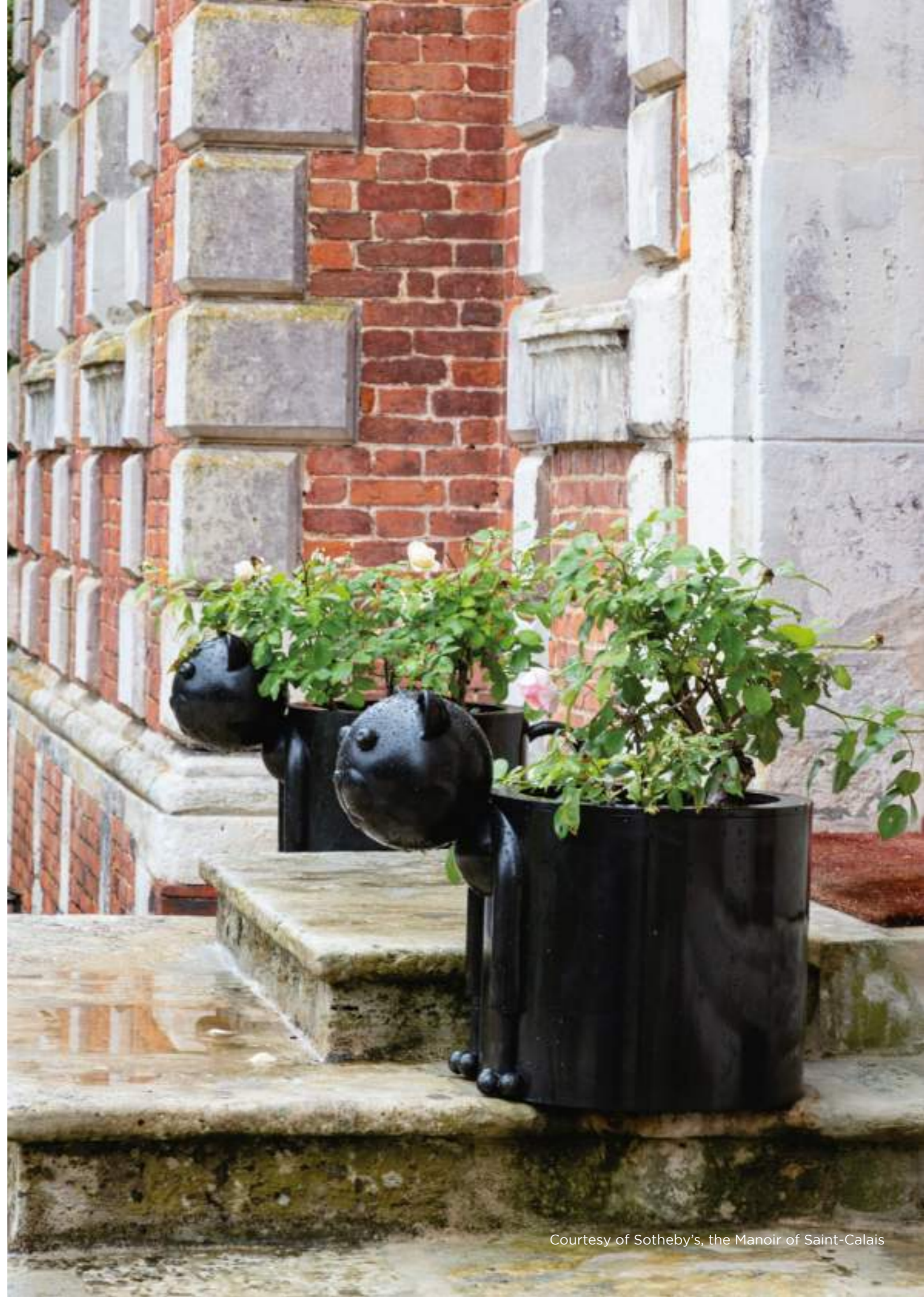
the Manoir of Saint-Calais