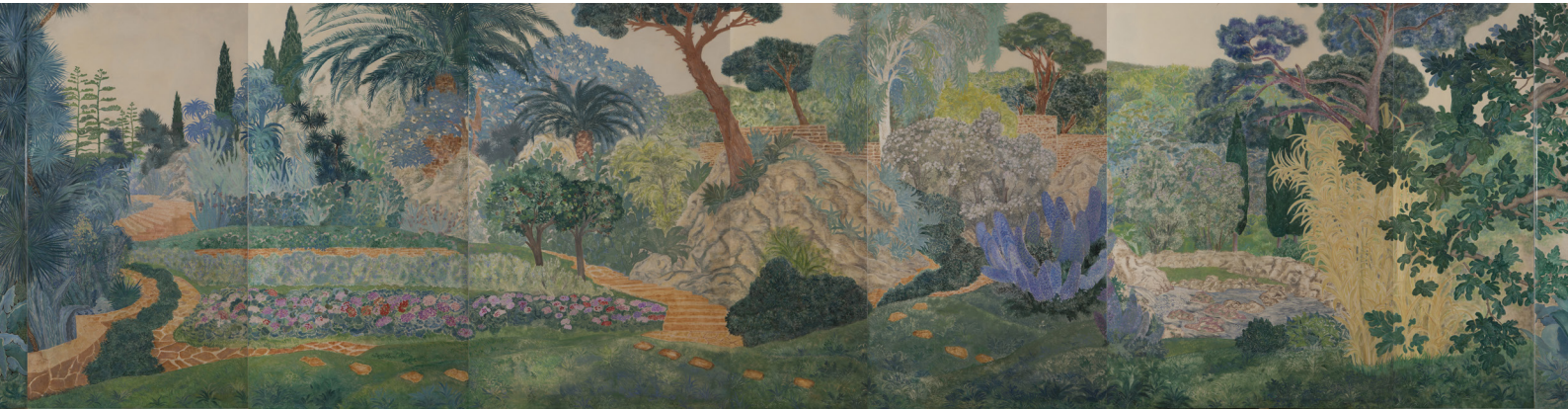
Camille ROCHE - The Mortola Gardens

Camille ROCHE's marvelous design representing a splendid garden can be considered the artist's masterpiece.