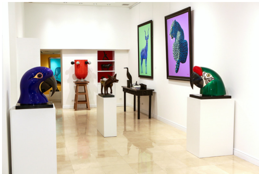
New York 475 Park Avenue