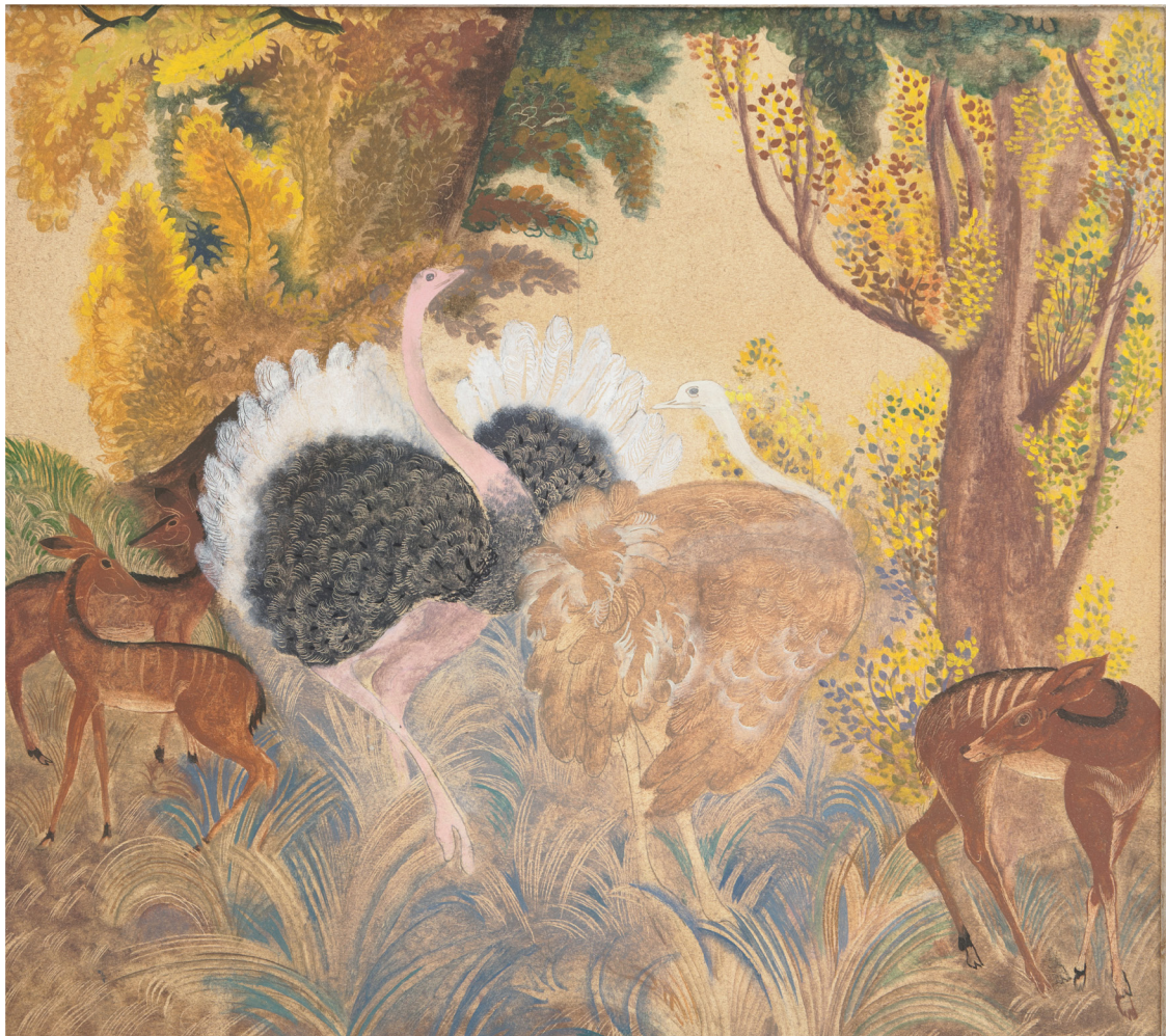
Camille ROCHE – Couple d'autruches et biches Projet de Paravent (Pair of Ostriches and Does, Design for a Folding Screen) Circa 1930 – Mixed media on paper, atelier's seal, 40 x 45.5 cm