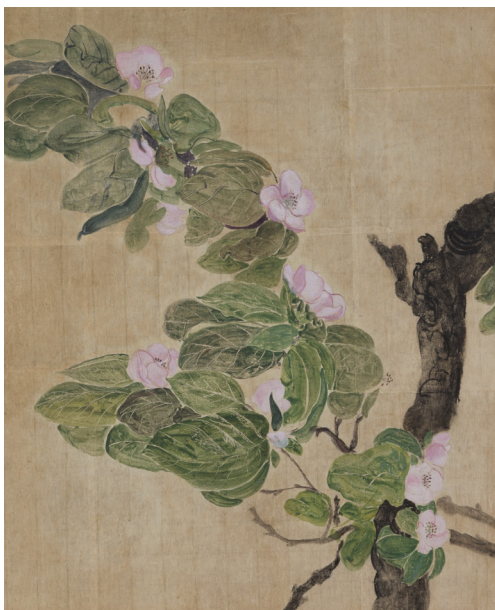
Camille ROCHE - Branche de cerisier (Cherry Tree Branch)

Mixed media on gold leaf, signed 30.5 x 39 cm