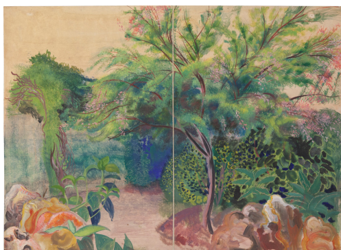
Camille ROCHE - Sous-bois (Forest Floor)

Mixed media on silver leaf, signed 87 x 167.5 cm