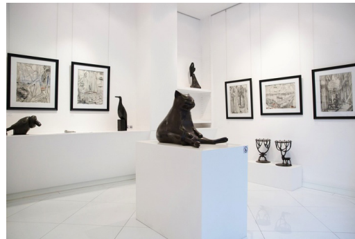
Shanghai Huangpu Qu, Fuxing Middle Road