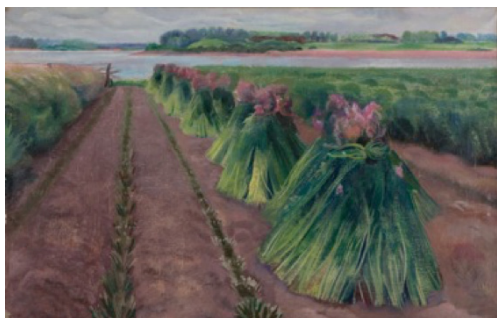
Camille ROCHE - Meules (Grindstones)