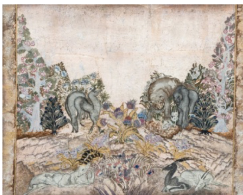
Camille ROCHE - Animaux dans la forêt (Animals in the Forest)

Screen with four panels, mixed media on tow paper, signed in the top right-hand corner 180 x 228 cm