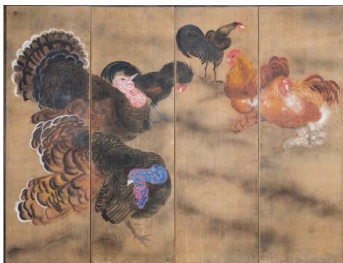
Camille ROCHE - Grand paravent aux poules dindons et coqs (Large Screen with Turkeys and Roosters)

Screen with four panels, mixed media on tow paper, signed in the top right-hand corner 180 x 228 cm