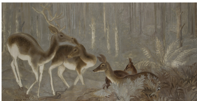
Camille ROCHE - Biches dans la forêt (Does in the Forest)

Mixed media on silver leaf, signed 87 x 167.5 cm