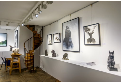
Paris 38 rue de l'Université – 75007 Paris