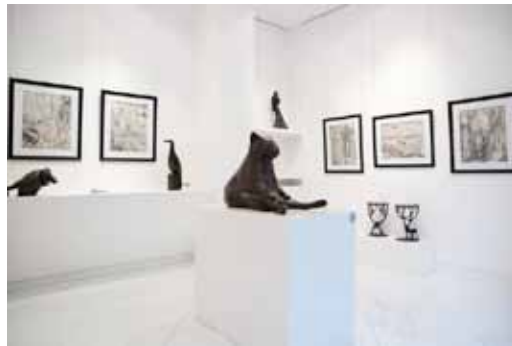
Shanghai Huangpu Qu, Fuxing Middle Road