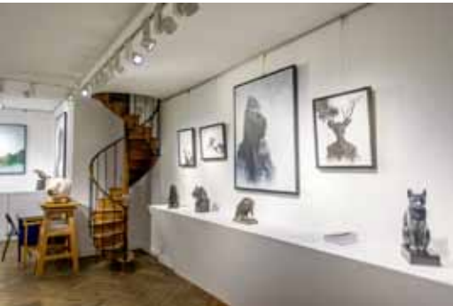
Paris 38 rue de l'Université – 75007 Paris