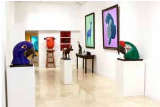
New York 475 Park Avenue