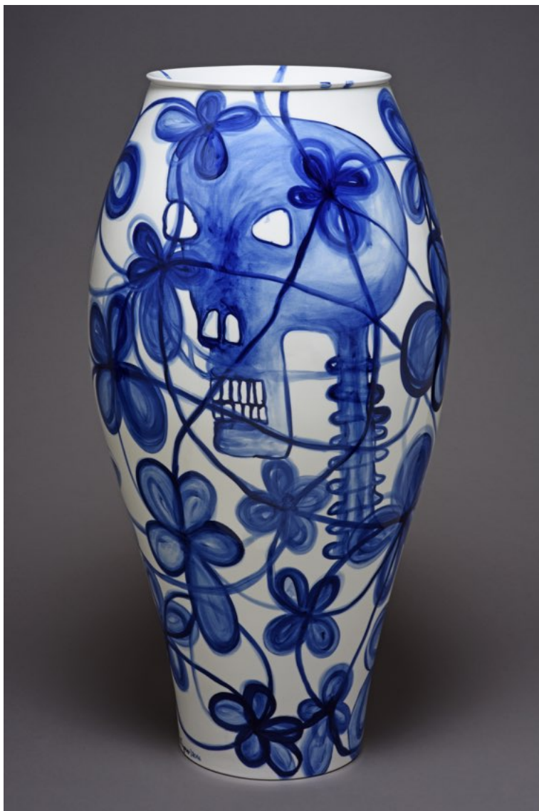
巴尔德莱米·图果 Barthélémy Toguo (出生于1967年) Grand vase Charpin 夏邦花瓶 2016年, 孤品, 瓷器, 柴窑烧制, 塞夫尔国家制造局 (Manufacture National de Sèvres) H:115 cm D: 43 cm