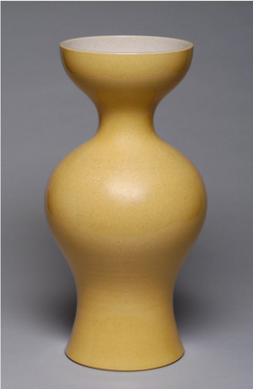
让·阿尔普 Jean Arp / Hans Arp (1866-1966) Vase Objet Casanier 平日物件 1966, 塞夫尔国家制造局 (Manufacture National de Sèvres) 炻器, 黄色, No. 8/10 H: 47.5 cm D: 23 cm